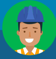
The New Way