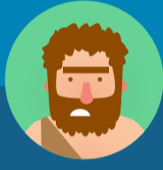
The Old Way